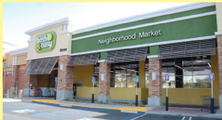
Another new store, Fresh & Easy, joined West Covina Heights, 2430 Azusa Ave., in February.

The XXI store will be located adjacent to the new Best Buy currently under construction at the mall and will occupy 29,720 square feet. Construction is anticipated to start this summer, and the store is expected to open in March 2010.